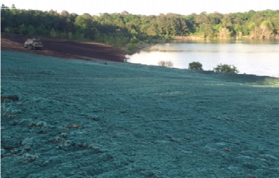
ProGanics and Flexterra applied to soil in April