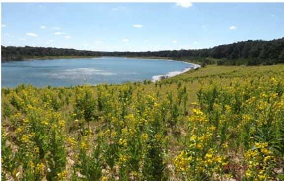
Sustainable vegetation one year later