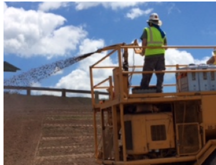
Top: Construction on the resort Bottom: ProGanics application on a slope