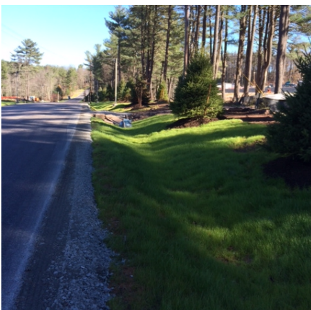
Follow-up inspections saw significant growth, including along the roadways

Profile's partners also took multiple soil tests across the site and found several areas with deficient soils. To restore the soil, the team applied ProGanics® Biotic Soil Media™ (BSM™), an Engineered Soil Media™ (ESM™) that provides the organic matter and soil-building components to modify the soil chemistry and initiate growth and sustainable vegetative establishment. With the long winter on the horizon, a team of hydroseeding companies quickly worked to apply the ProGanics and Flexterra to the site. Within a few weeks, vegetation began to establish. The engineering firm noted the Flexterra application held the seed and soil in place, eliminating worries about sediment pollution. During follow-up inspections in 2018, the site had established sustainable vegetation. The success of this project earned Profile the opportunity to consult on additional projects on the site over the next few years.