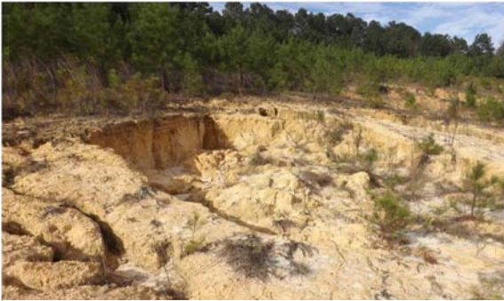
Large gullies formed due to erosion