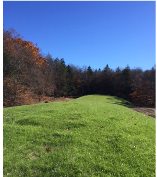
Vegetation began to establish within weeks of application, and the site was fully vegetated in follow up inspections one year later

After grading finished on portions of the Empire Resorts Casino in 2016, the resort wanted to establish vegetation on more than 100 acres (40 ha) of land with hydraulically applied cellulose mulch. However, the engineering firm working on the site questioned how successful the low-performing product would be. With waterbodies nearby, the engineering firm determined the risk for sediment pollution was high.